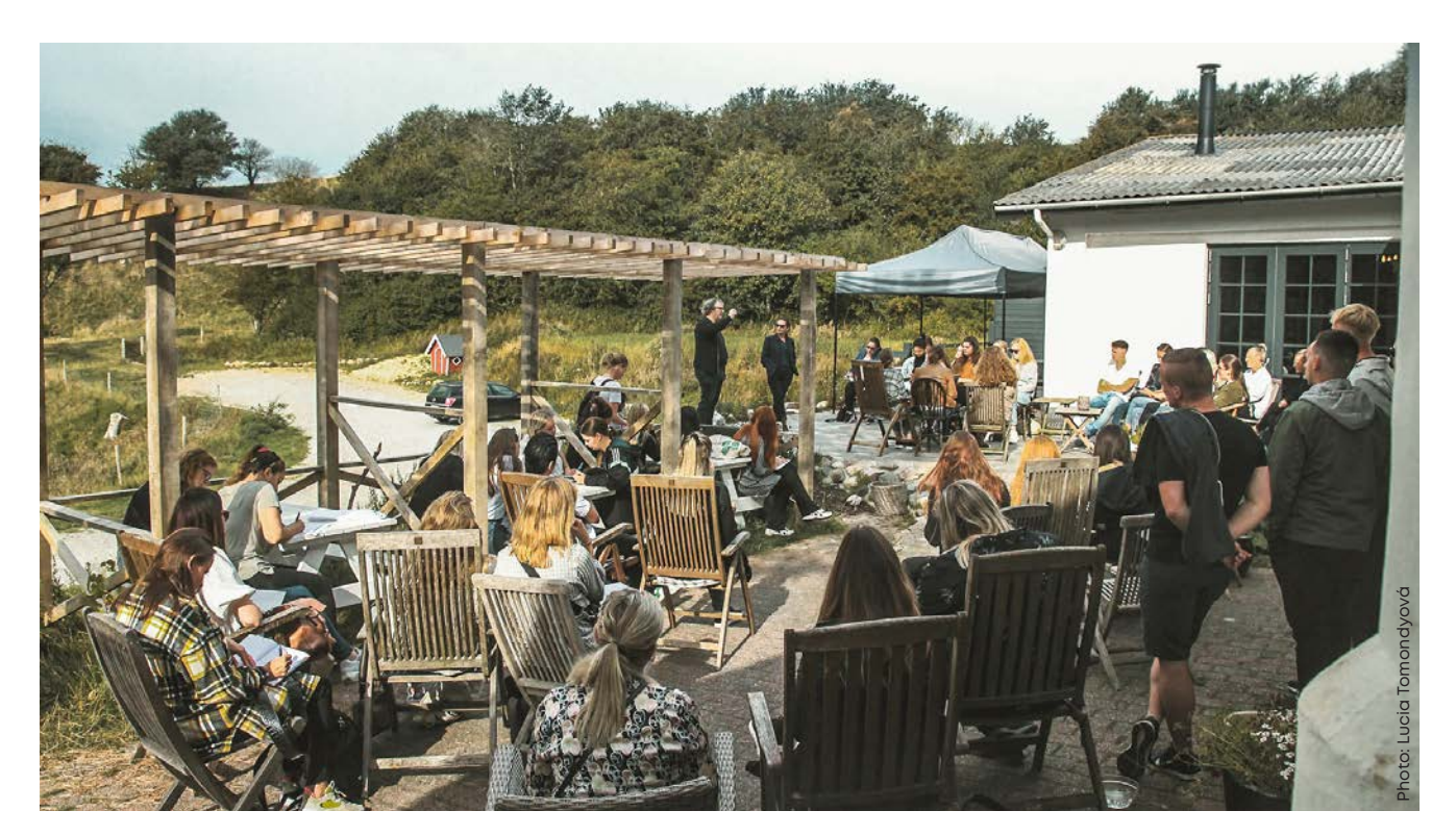
IHM students on a 'mixed' company visit at Næsbydale hotel in North Jutland.

"by definition". They see the international perspective as an inherent way of perceiving and learning about the world. However, the respondents' worldview does not match the programme context. After gradugting, most home students seek employment locally, in North Jutland. The local labour market is not seen as part of the global market; the region has some large international companies, but foreign language proficiency or intercultural skills are not critical for employment. The regional labour market has yet to create a sense of urgency to internationalise the curriculum further, and the lecturers acknowledge that: